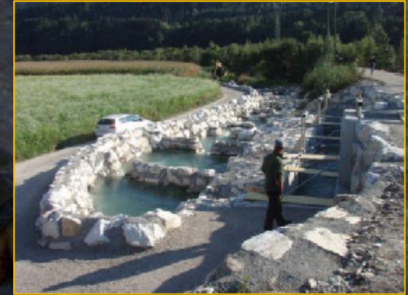
Kellerberg, Drava, Austria